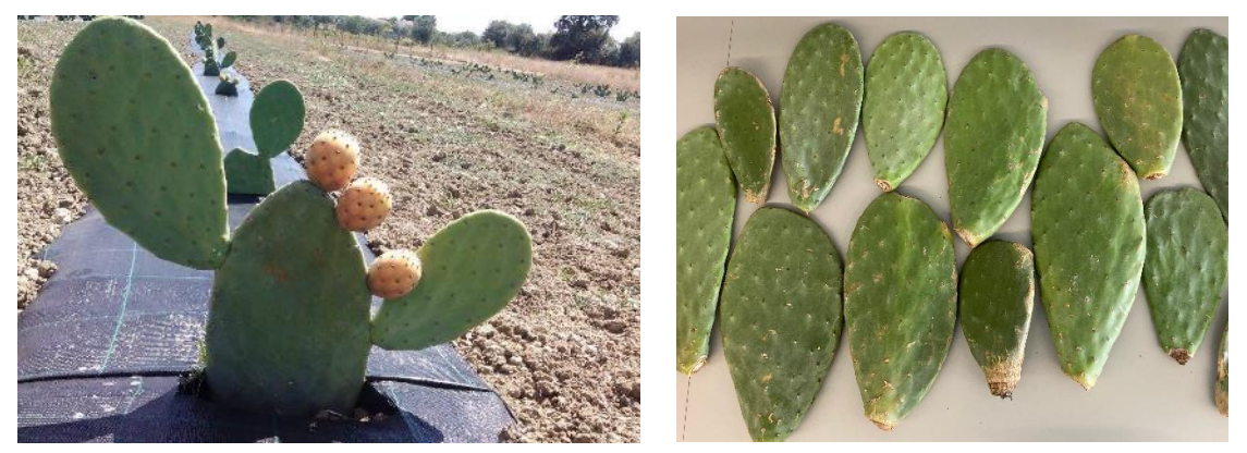
Figure 1: (A) - Opuntia ficus-indica (L.) Miller cladodes in the field; (B) - Selected cladodes.

The cladodes (Figure 1) were harvested in November 2021 from a crop of Olaia Natura, a company from Torres Novas, Portugal. All cladodes belonged to the orange variety, thus giving rise to orange-fleshed fruits. Immediately after being harvested, the cladodes were packed and transported to the laboratory where they were promptly prepared.